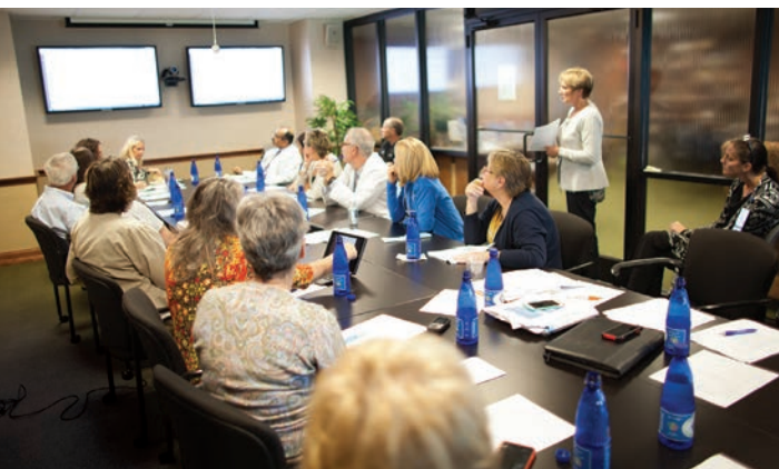
The Cancer Committee 2015 November meeting