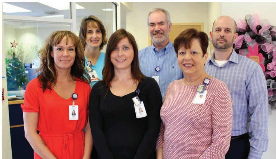
Radiation Therapy Center Team

The chart to the right illustrates what the study revealed. Of the 74 cases reviewed for 2014, 99% were found to be both peer reviewed and guided by National Cancer Control Network evidence-based best practice guidelines.