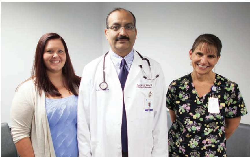
Outer Banks Oncology Group