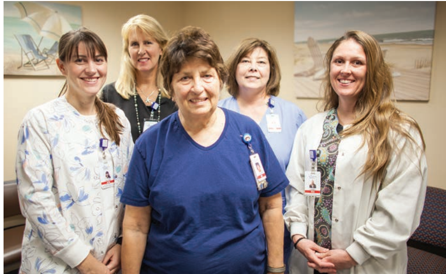
Ambulatory Medical Unit Team