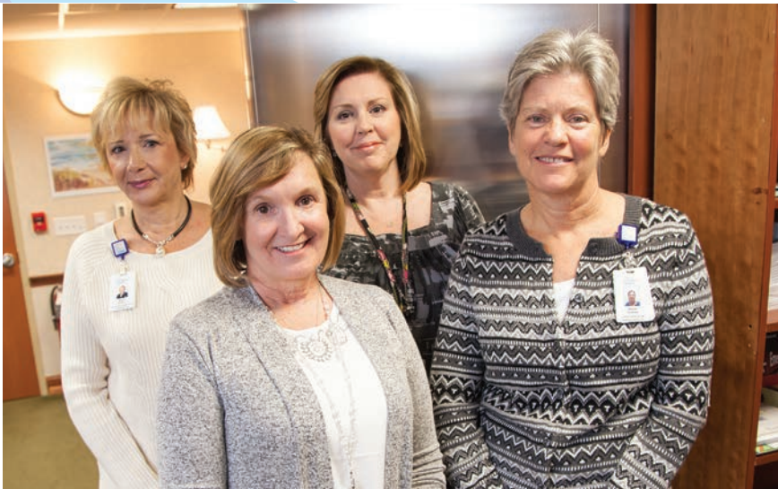
Cancer Care Staff

The Outer Banks Hospital's Cancer Care Team includes the Cancer Services Staff, Hands of Hope Volunteers, Radiation Therapy Center Team, Ambulatory Medical Unit Team, Symptom Management Clinic Team and the Cancer Committee.