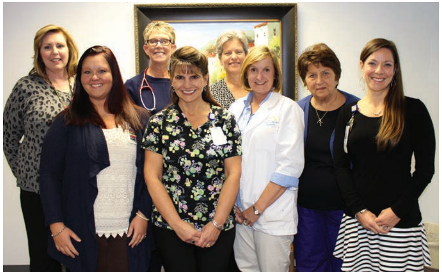
Symptom Management Team