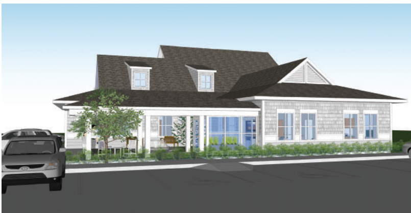
Rendering of the new Outer Banks Hospital Radiation Therapy Center.

This year was another big year for The Outer Banks Hospital Cancer Program. We are well on our way