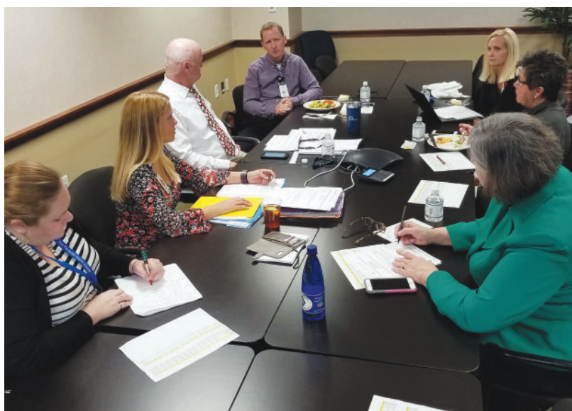
Members of The OBH Development Council at a recent meeting.